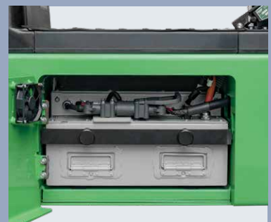
Lithium battery pack