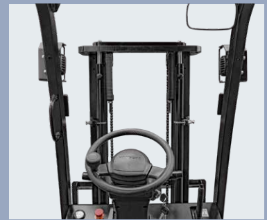
Wide view mast